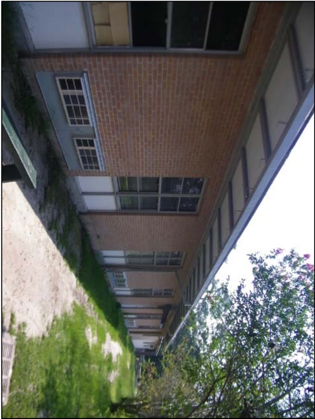
EXISTING BLDG. B (#1978) ROOF PHOTOS N.T.S.